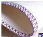
3-thread overlock, wide & narrow Seam, overcast the edge and trim away excess fabric in one step.