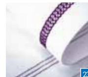
Coverstitch triple For hems on stretch fabrics and for decorative effects on all kind of fabrics. Use decorative thread in looper for embellishment.