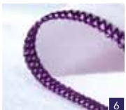
2-thread narrow edge Edge finish for light and medium weight woven fabrics and lightweight knits.