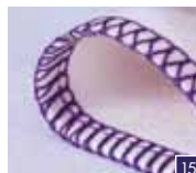
4-thread overlock Seam, overcast the edge and trim away excess fabric in one step. For all seams where stretch or give is needed, such as neck edges, side seams, sleeves.