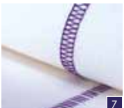
2-thread flatlock, wide Sew stretchy fabrics together with decorative effect, or finish edges of medium weight fabrics.