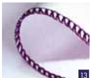
3-thread rolled edge Give a professional finish to silky scarves, pillow ruffles and napkins.