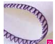
3-thread wrapped overlock wide Perfect for finishing skirts or as lettuce edge on fine fabrics.