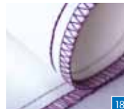
5-thread safety stitch, narrow A durable chainstitch seam with overlock edge sewn in one step, for garment sewing, quilt piecing and other projects.