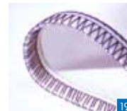
5-thread safety stitch, wide A durable chainstitch seam with overlock edge sewn in one step, for garment sewing, quilt piecing and other projects.