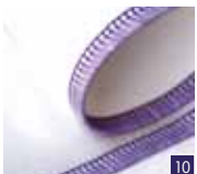
3-thread stretch overlock For sewing extra stretchy light or medium weight fabrics. (Add additional stretch by using a stretchy type thread in the loopers.)