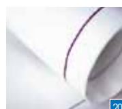
Chainstitch For all types of sewing such as construction, hemming and piecing quilts. Use decorative thread in looper for embellishment.