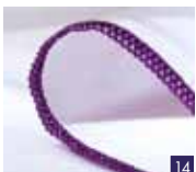
3-thread narrow edge Give a professional finish to silky scarves, pillow ruffles and napkins.