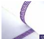
3-thread flatlock, wide For sewing stretchy fabrics together with a decorative effect either with the flatlock side or the ladder stitch side.